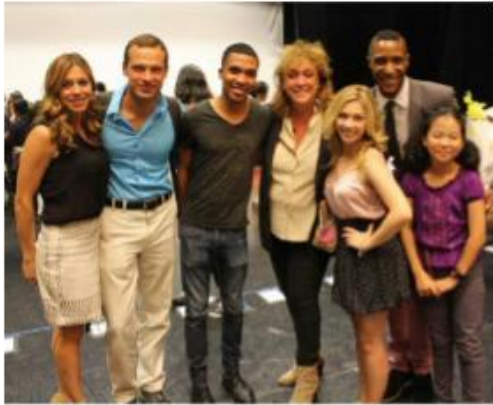
Broadway Guests and Artistic Staff at Passport to Broadway South Korea Summer 2013