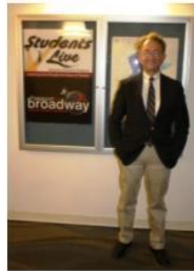
Tony Award Winning Costume Designer William Ivey Long at Passport to Broadway South Korea Summer 2013