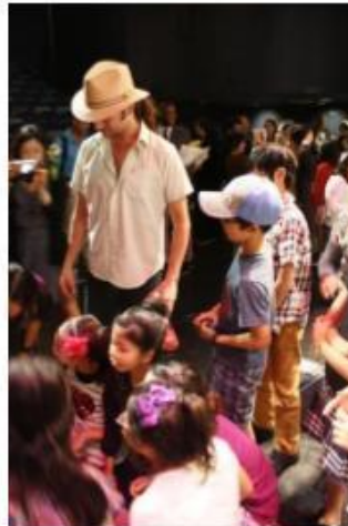
Broadway Actor Constantine Maroulis with South Korean Students Summer 2013