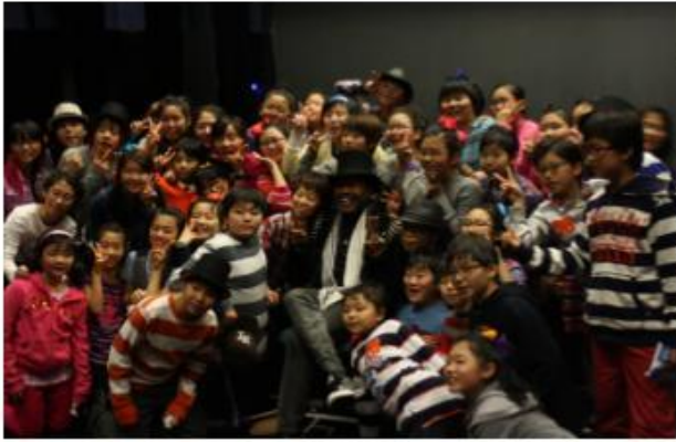
Theater Legend Ben Vereen with South Korean Students Winter 2013